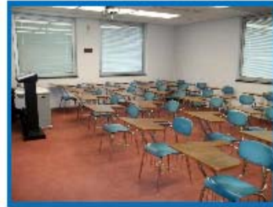
Modern classrooms for indoor activities (Desks will be replaced with tables and chairs for camp)